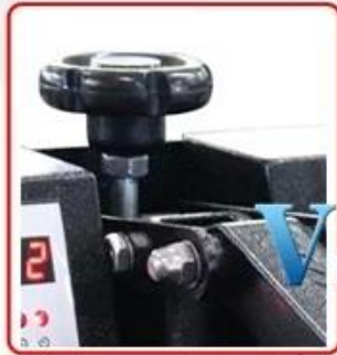
Stronger iron vertical chassis & Adjustable Press Pressure