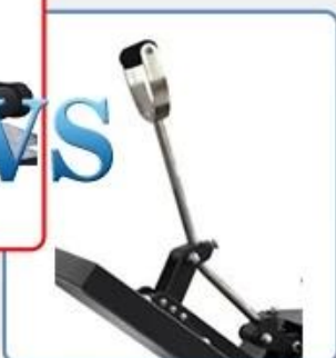
Normal metal handle, easy to break