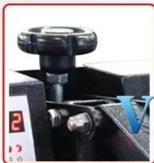
Stronger iron vertical chassis & Adjustable Press Pressure