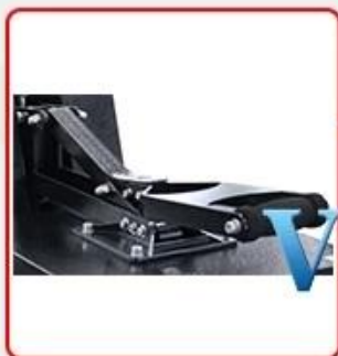
Stronger iron handle