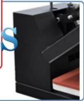
Normal plastic housing, easy to break during the shipping