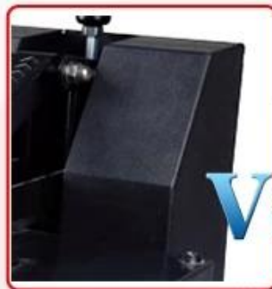
Iron electric box, stronger housing