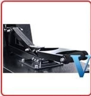
Stronger iron handle