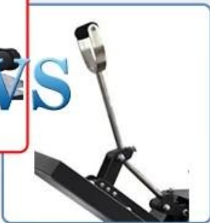
Normal metal handle, easy to break