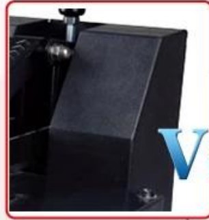
Iron electric box, stronger housing