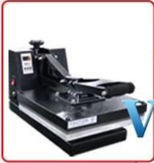
Stronger structure with high pressure