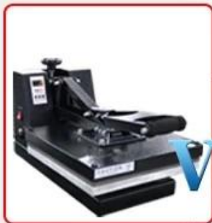
Stronger structure with high pressure