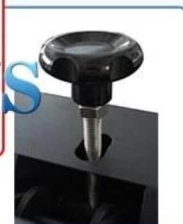
Simple vertical chassis