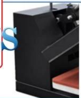
Normal plastic housing, easy to break during the shipping