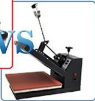
Simple and weak structure with lower pressure