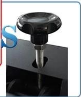
Simple vertical chassis