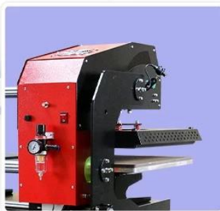
Power-off Protection Safety Lock Mechanism