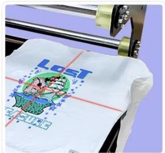
Precise Alignment Effortless Operation