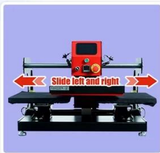
Manual & Auto Mode Streamline Printing