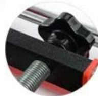
High Quality Accessories