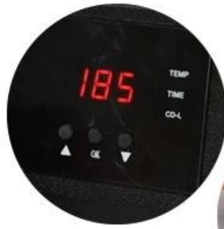
High End Gy-04 Digital Controller