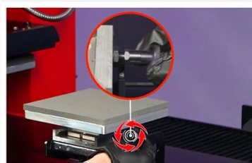
Quick-change Lower Platen