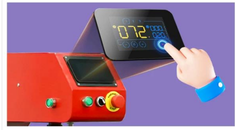
GY-13 Touchscreen Controller