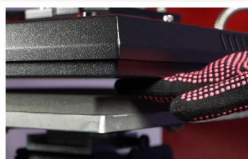
Pinch-Guard Safety System