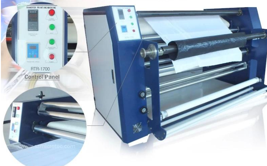
Front Portion of Machine's Left Cabinet

Available Printing Width: 1.7m(67")/2.5m(98")/ 3.2m(126") Model No.: RTR-1700/RTR-2500/RTR-3200