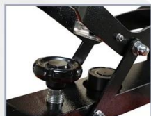
Pressure Adjustable Knob