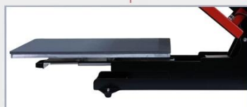
Slide-out Press Bed