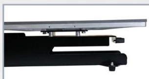
Fully Threadability on Lower Platen