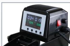
GY-06 Digital Controller