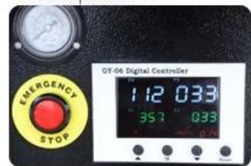
GY-06 Digital Time & Temp. Control