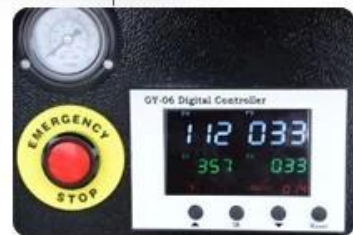
GY-06 Digital Time & Temp. Control