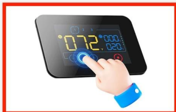
Touch Screen Control