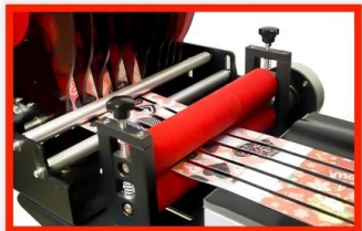
Feeding Pressure Roller