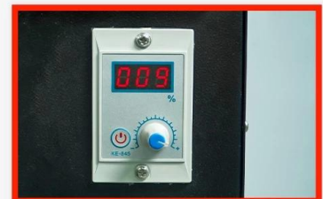
Tension Adjustment Knob