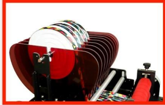
Adjustable Lanyard Dividers