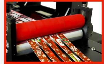
Collecting Pressure Roller