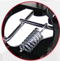
High quality accessories