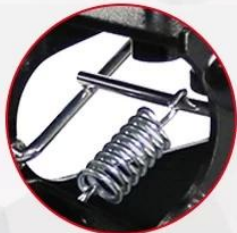
High quality accessories