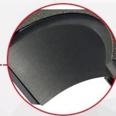
Baked with Teflon coating