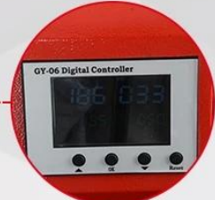
GY-06 Digital Controller C&F Read-out and Press Counter