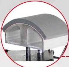
Easy cap mounting clamp