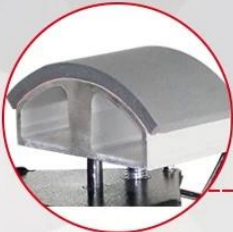
Easy cap mounting clamp