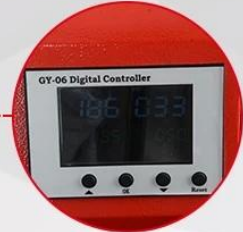
GY-06 Digital Controller C&F Read-out and Press Counter