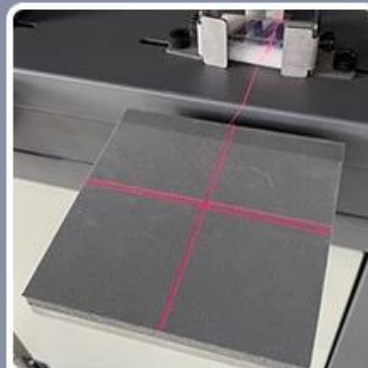
Precise positioning function