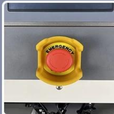
Emergency Stop Switch