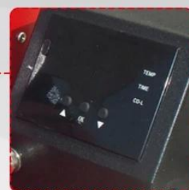
GY-04 Digital Time & Temperature Controller