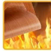
High Temperature Resistance