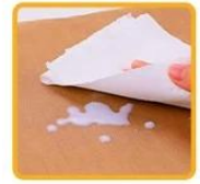
Durable Easy to Clean