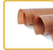
Upgraded Thickness 0.11mm