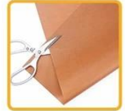
Easy to Trim Reusable