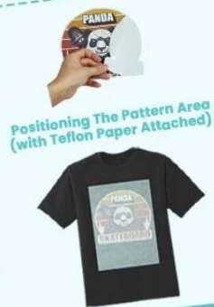
Step 2: Cutting out and peeling off the pattern