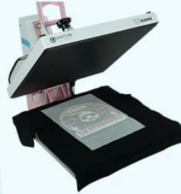
Step 3: Transferring The Pattern