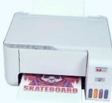
Step 1: Printing The Pattern