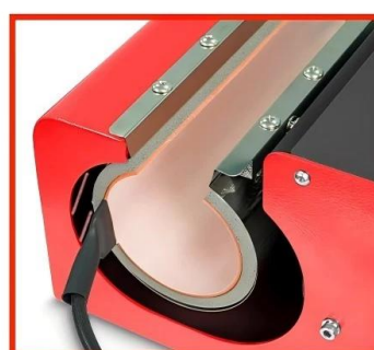
Exchangeable Mug Heater