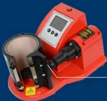
MP-99 Digital Mug Press