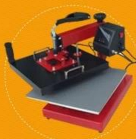
Digital Swing Away Heat Press Model No.: DCH-100