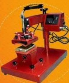
Curved Wine Pot Heat Press Model No.: DCH-100-W