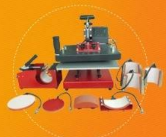
Digital Combo Heat Press Model No.: DCH-800