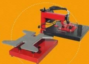
Shoe Heat Press Model No.: DCH-100-S