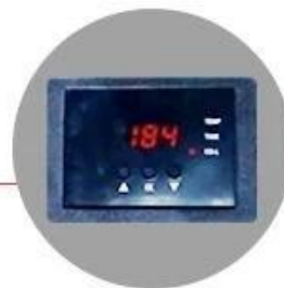
GY-04 Digital Controller: Accurate in time and temp. display