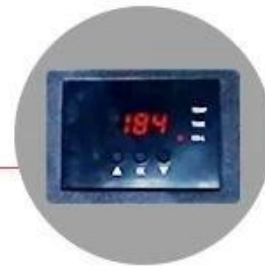
GY-04 Digital Controller: Accurate in time and temp. display