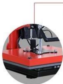
12"*15" Size: Popular size and versatile