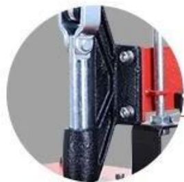
Limited Rod: Stand still, more safety