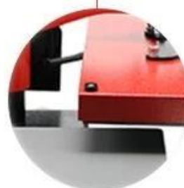
Swing Away Design: Safe easy to use, and better pressure