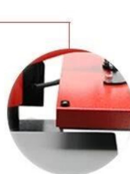
Swing Away Design: Safe easy to use, and better pressure