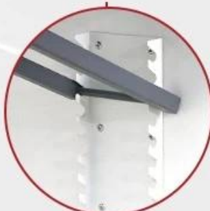
Infeed - Adjustable Table Inclination