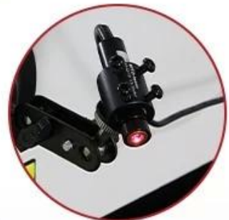
Infrared Positioning System