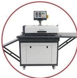
Outfeed - Adjustable Table Inclination