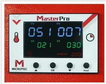
GY-06 Digital Controller