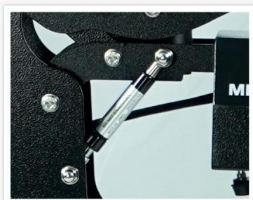
Gas Shock Opening