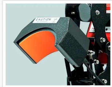
Upper Heating Platen