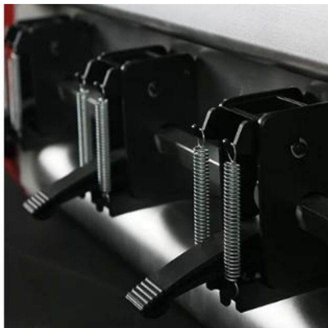
Double spring design, uniform pressure Easy to operate and adjustable Read More