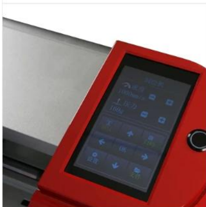
Large LCD touch screen