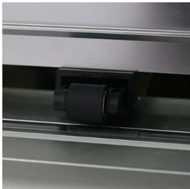
one-in-all barbed steel high cutting accuracy