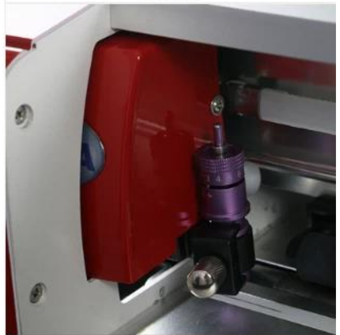
Smart hidden carriage