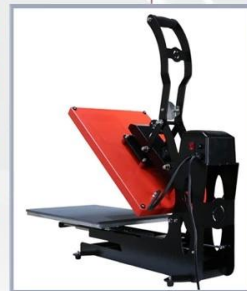
Solid Steel Framework