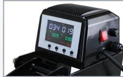
GY-06 Digital Controller