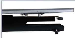
Fully Threadability on Lower Platen