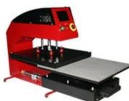
Pneumatic High Pressure Draw-out Heat Press Item No.: APD-20/24 Heat Platen Size: 40x50/40x60cm