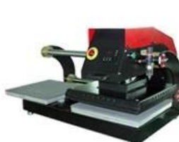
Pneumatic Double Location Shuttle Heat Press Item No.: APDS-15/20 Heat Platen Size: 38x38/40x50cm