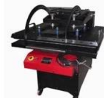
Semi-automatic Manual Large Heat Press Item No.: STM Heat Platen Size: 60x80cm, 80x100cm, 100x120cm, 100x140cm