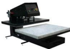
Pneumatic Large Format Draw-out Heat Press Item No.: APHD-40 Heat Platen Size: 75x105cm