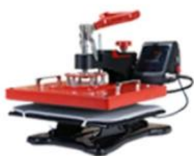
T-shirt Heat Press