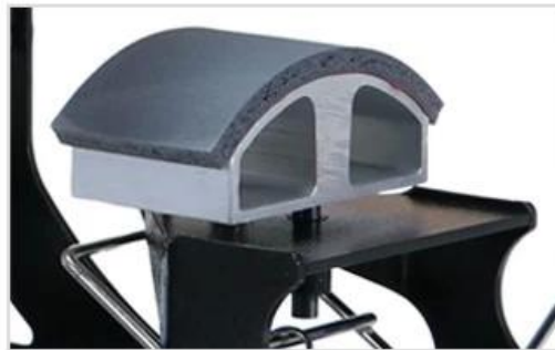
4 Quick-change Hat Under Plate