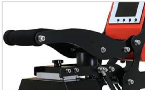
6 Strong Durable Machine Metal Frame