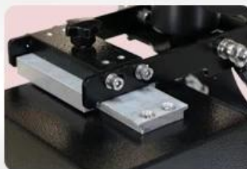
Quick Slide-out Heat Platen