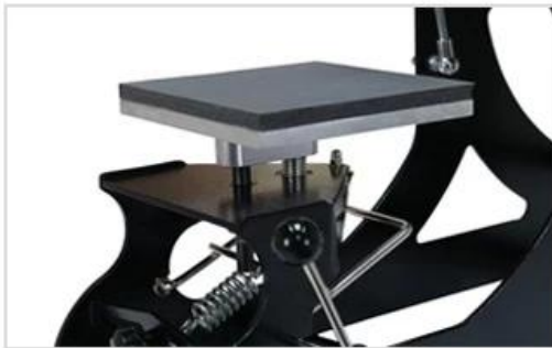
3 Quick-change 15x15cm Under Plate