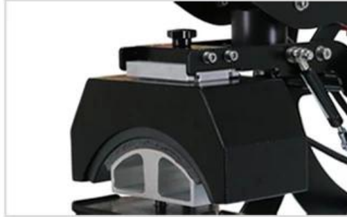
2 Slide-out Hat Platen