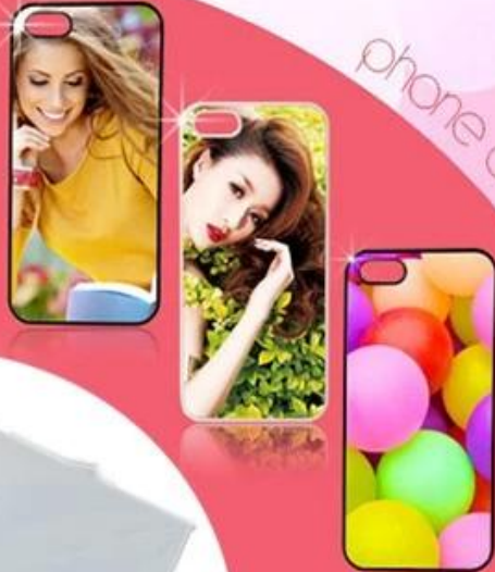
iPhone 5 Case