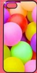
iPhone 5 Case