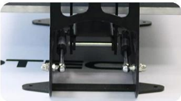
Pluggable Electric Box

00 00 0 00: 0 0 0 00 00 00 00 0 00000 00 00 0 00