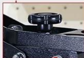
Adjustable Press Pressure