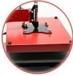
12"*15" Size: Popular size and versatile