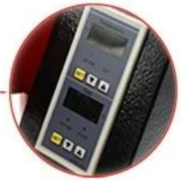
Vertical Digital Controller: Accurate in time and temp. display