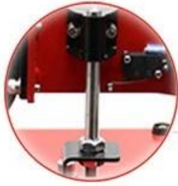
Limited Rod: Stand still, more safty