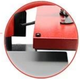
Swing Away Design: Safe easy to use, and better pressure