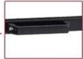
Draw-out Under Plate