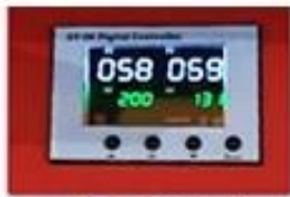
GY-06 Digital Time & Temp. Control