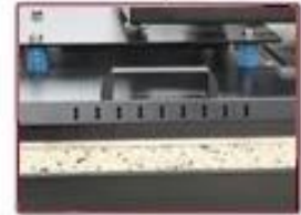
Anti-scald Protection Metal Cover