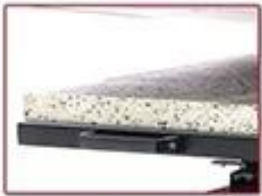
Recycled Cotton Pad