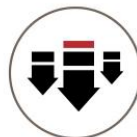
High Pressure Application