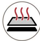
Even Heat Even Pressure