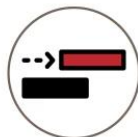
Slide-out for Easy Use