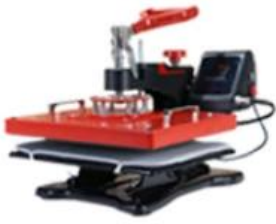
T-shirt Heat Press