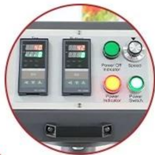
Movable REX-C400 Digital Controller

Continuous Transfer Printing Machine: OTO-24 Print Width: 60cm