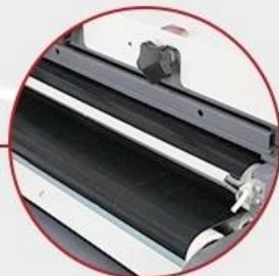
Upper and Lower Heating Rollers