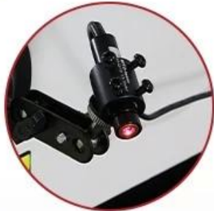
Infrared Positioning System