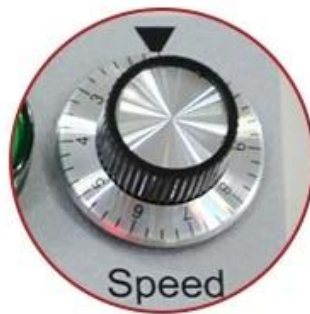
Speed Control Button