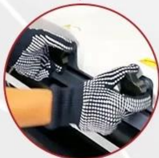
Adjustable Pressure Settings