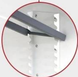
Infeed - Adjustable Table Inclination