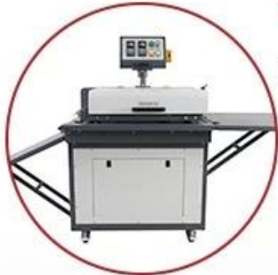
Outfeed - Adjustable Table Inclination