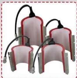
4 size mug heater for option