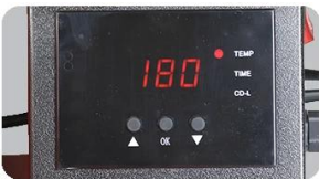
GY-04 Microtec Laser Module Control Panel