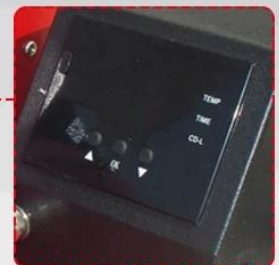
GY-04 Digital Time & Temperature Controller