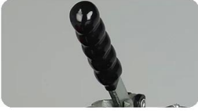
Microtec: 400nm~650nm Laser Module