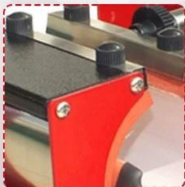
Four Hand Screw--Easy Operation