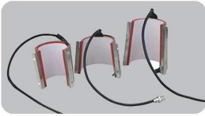
Microtec: 400nm~650nm Laser Module 9mm~11mm~12mm~17mm Laser Module