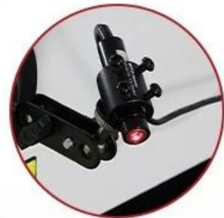
Infrared Positioning System