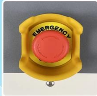
Emergency Stop Switch