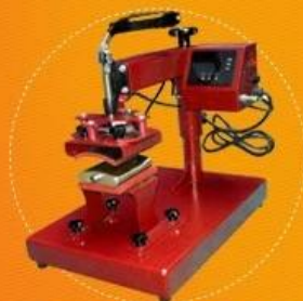
Curved Wine Pot Heat Press Model No.: DCH-100-W