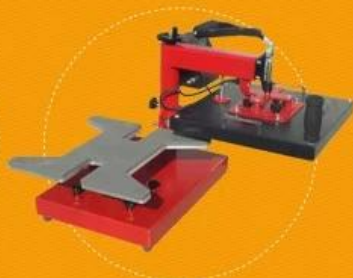
Shoe Heat Press Model No.: DCH-100-S