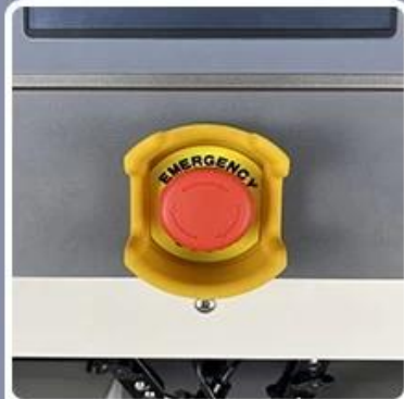
Emergency Stop Switch