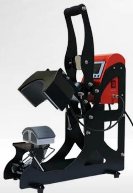
Quick Slide-out Heat Platen