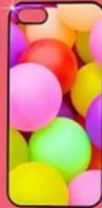
iPhone 5 Case