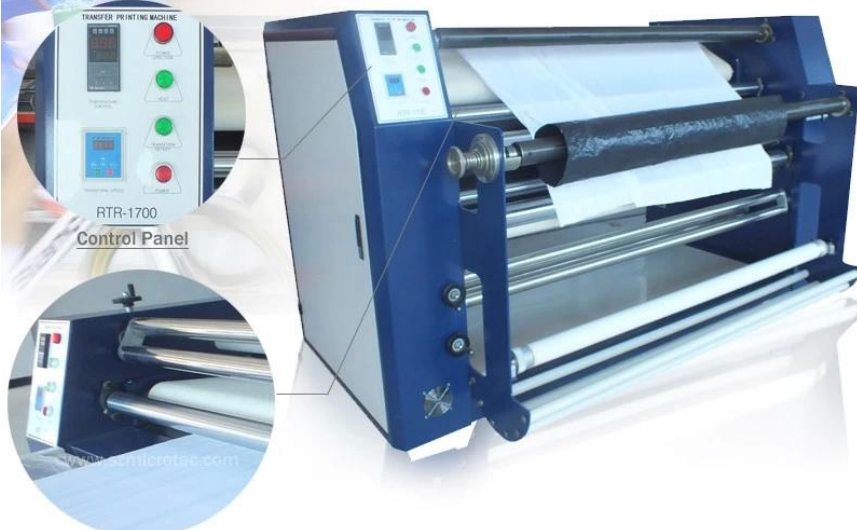
Front Portion of Machine's Left Cabinet

Available Printing Width: 1.7m(67")/2.5m(98")/ 3.2m(126") Model No.: RTR-1700/RTR-2500/RTR-3200