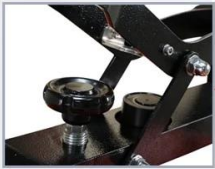
Pressure Adjustable Knob