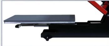
Slide-out Press Bed