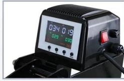
GY-06 Digital Controller