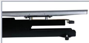
Fully Threadability on Lower Platen