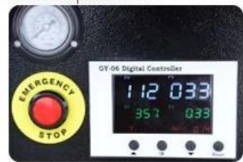
GY-06 Digital Time & Temp. Control