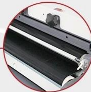
Upper and Lower Heating Rollers