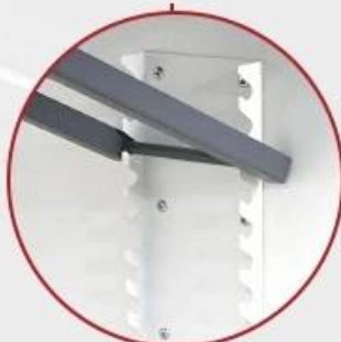
Infeed - Adjustable Table Inclination