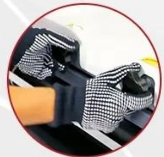
Adjustable Pressure Settings