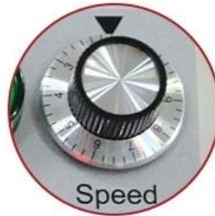
Speed Control Button