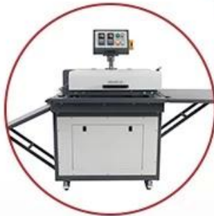
Outfeed - Adjustable Table Inclination