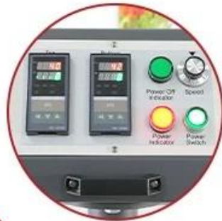
Movable REX-C400 Digital Controller

Continuous Fabric Fusing Machine: OTO-24 Plate Size: 40x60cm (16"x20")