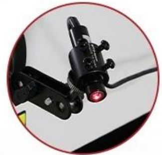
Infrared Positioning System