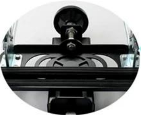
Sealing rubber strip