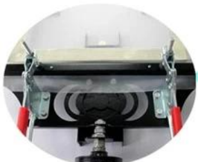
IT' s sealed tight when making the frame