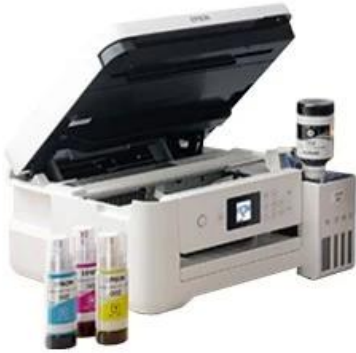
Inkjet Printer Sublimation Ink

Work with sublimation ink and heat press