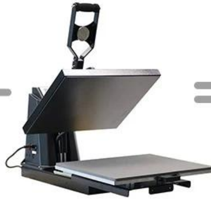
Transfer with Heat Press