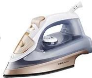
Transfer with Iron