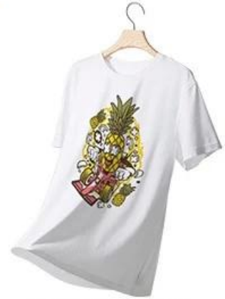
Light colored material with cotton content < 30%