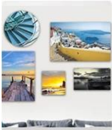
HD Metal Prints

This Electric powered full auto heat press machine is suitable for any sublimable or transferable product. For example: T-shirts, photo frames, slippers, mouse pads, sportsware and other flat products.