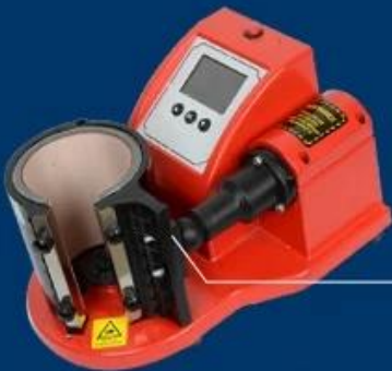
MP-99 Digital Mug Press