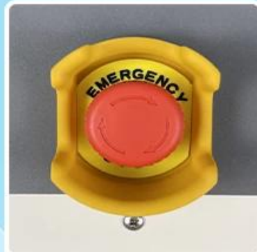
Emergency Stop Switch