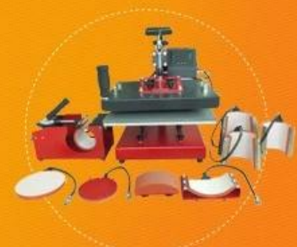
Digital Combo Heat Press Model No.: DCH-800